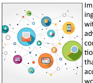
Imagine doing your job without the advanced communications tools that you have access to. It would make

things much less efficient. Most organizations use all types of different solutions to be able to support their workforce and customers, but in today's business, there are three solutions most organizations have come to depend on. Let's take a look at these three today.